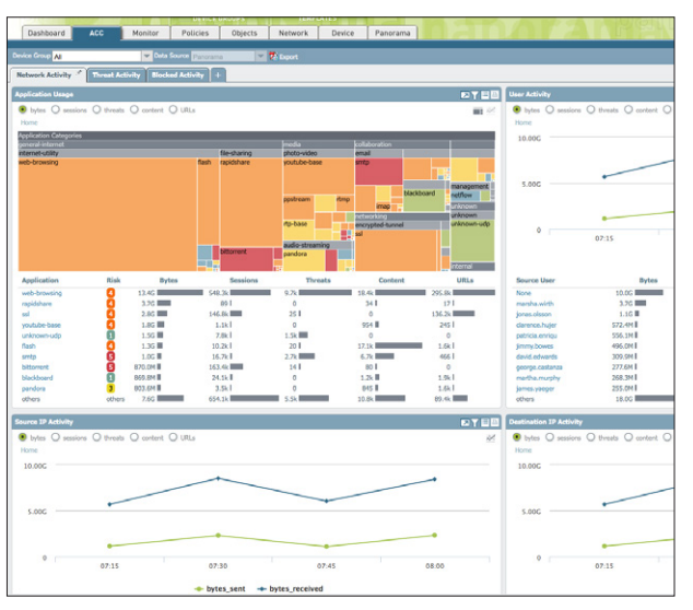
Figure 1: ACC

Automated threat correlation, with a predefined set of correlation objects, cuts through the clutter of monstrous amounts of data. It identifies compromised hosts and surfaces correlated malicious behavior that would otherwise be buried in the noise of too much information. This reduces the dwell time of critical threats in your network. A clean and fully customizable Application Command Center provides comprehensive insight into current and historical network and threat data.